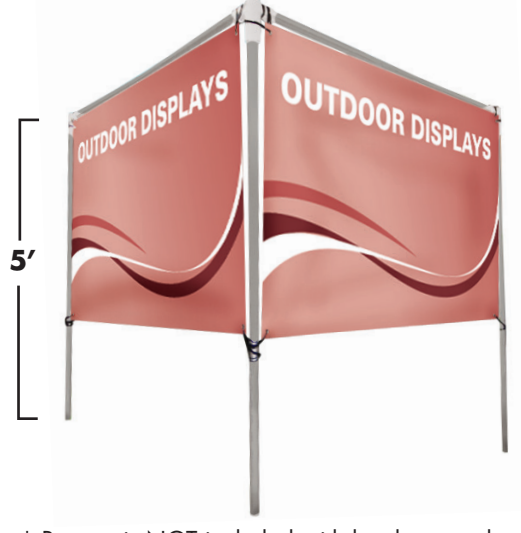
* Banner is NOT included with hardware only